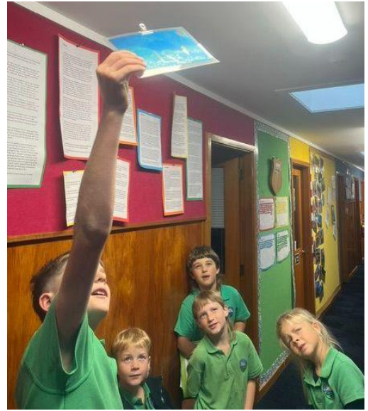
Monty shows how Cyan, Magenta and Yellow layer to make realistic colours

Whaea Regan took us for a special project on Monday, creating clay flowers to add to the developing sensory garden. The patience, creativity and skill shown in these are outstanding and I can't wait to see them once they are out in the garden!