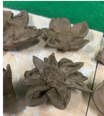
Some beautiful flowers

Whaea Regan took us for a special project on Monday, creating clay flowers to add to the developing sensory garden. The patience, creativity and skill shown in these are outstanding and I can't wait to see them once they are out in the garden!