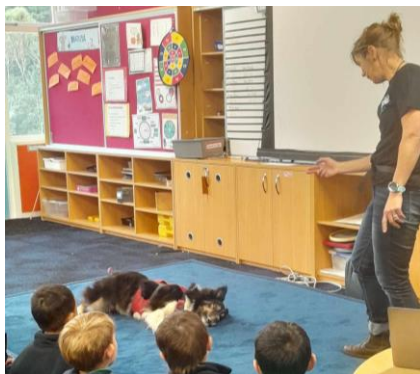
Echo shows off some of his other tricks