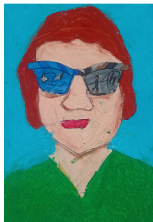
Self Portraits by Brodie