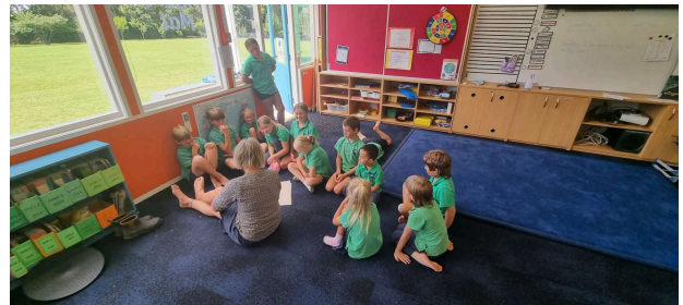
Pihanga Whānau Group