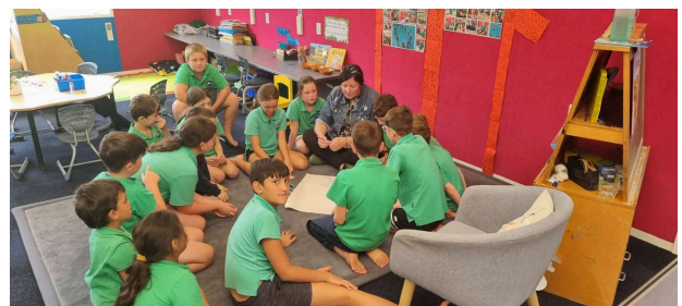
Ruapehu Whānau Group