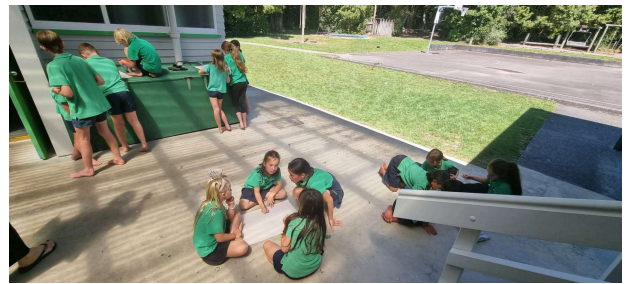
Tongariro Whānau Group