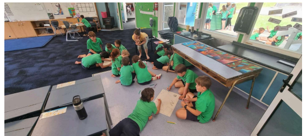
Ngauruhoe Whānau Group