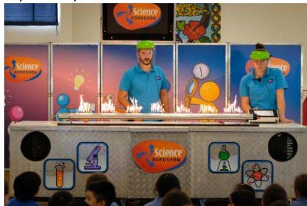
One of the activities is a demonstration of science

The show finishes at 10:30 so we will be back at school at 11:00am. As we are going by bus, we will not be sending out a transport / permission slip. Please contact the school if your child does not have permission to attend this compulsory trip that is part of our science curriculum.