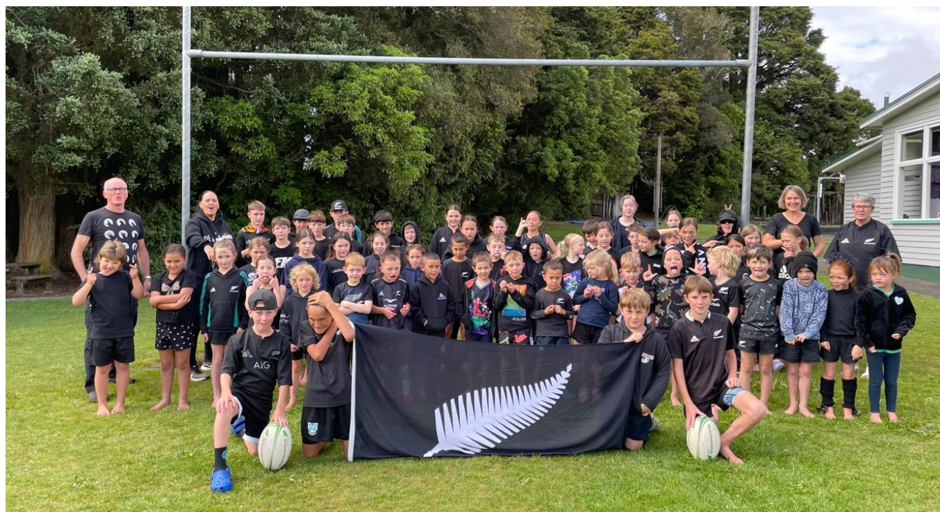
All Blacks' Day