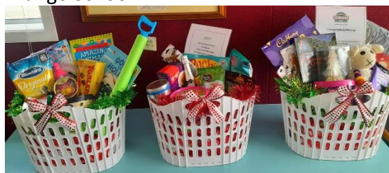
The three prizes

Tickets are $5 each and entitle the buyer to one entry into our draw. The draw will be held on the 3rd of December and consists of three great prizes. Thank you for supporting our wonderful Ōwhango School P.T.A.