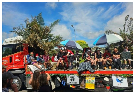
The float decorated in the Kiwiana theme