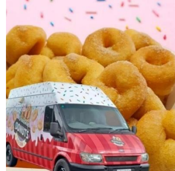
Double Up Donuts courtesy of the PTA