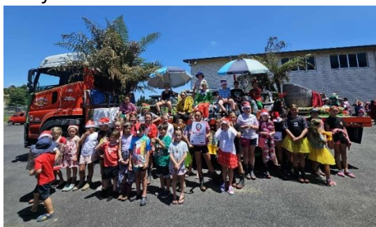
We had a good turnout of children who sang the whole way, as playing music on speakers was banned