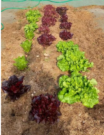
The delicious lettuce plants growing in our garden

Several weeks ago our Kowhai students planted lettuce in the school garden. As you can see, they are looking fabulous and ready for salads. WE WILL BE SELLING THESE THIS THURSDAY AT THE SCHOOL GATE FOR $2 EACH. PROCEEDS ARE FOR THE CLASS CHRISTMAS PARTY.