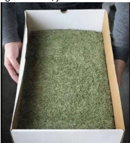
Make your own Christmas Tree- festive fun for the whole family

Would you like a make-your-own Christmas tree? Free to a good home; just ask Whaea Siobhan.