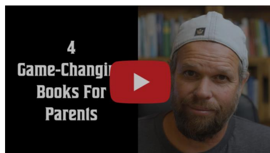
Control + Click to follow the link

https://www.youtube.com/watch?v=hYwy3wTBfhk