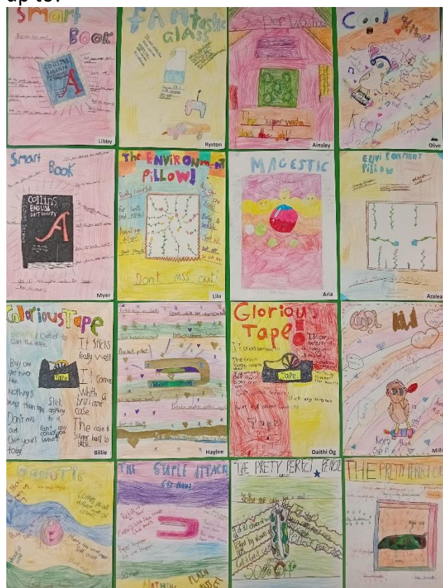
Advertisements by Kahikatea

We also learnt how to use persuasive language features to create an advertisement. We chose an everyday object from our classroom and our challenge was to include all of the features we had learnt about to convince you to buy our product. Here are a few of our examples... And remember, you are always welcome to pop into Kahikatea and see what else we have been up to!