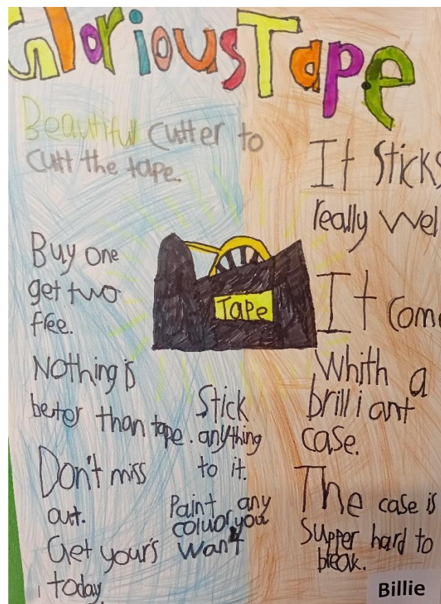
Billie's advertisement for Glorious Tape