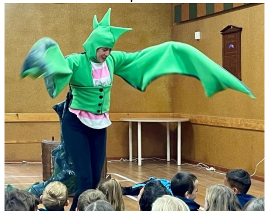
The smelly dragon