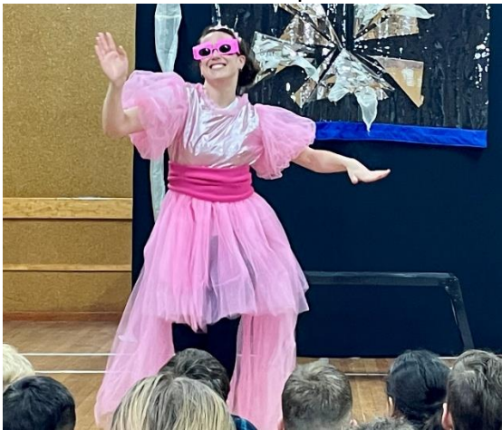
The social media influencer

Today we had a performance by Co Physical Theatre in the hall. The play, Speak Up Friend is a play for years 1 to 8 about having the courage to speak up for your friend. It is about bravery, friendship, spiders and weaving broken things back together. It was an excellent opportunity for our students to see some live, professional theatre and managed to captivate their attention for the whole hour. See the photos below.