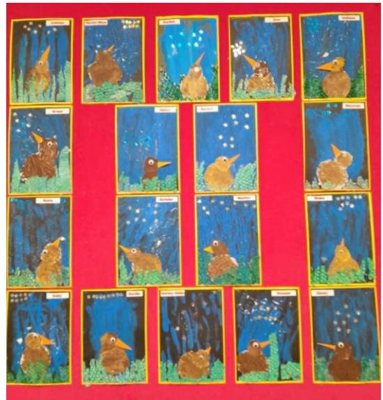
Little Kiwi art on display in Kōwhai class