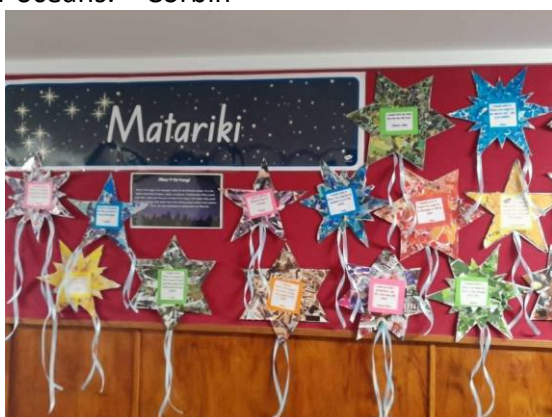
Collage art with wishes to Hiwa-i-te-rangi

"I would wish to Hiwa-i-te-rangi for no rubbish in our oceans." -Corbin