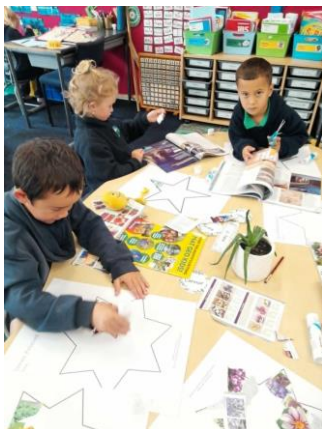
Having fun with collage art

This week students are creating one large multi-media artwork over the course of the week. Now that they have built on their knowledge of each whetū, they have chosen the one they feel most connected to and are designing mask-centred artworks based on their choices. They have taken time to explore ideas and materials and planned their creations in advance for guidance. The abstract idea has been hard mahi for some, choosing colours and materials that match with their themes, but students have been focussed on making them really visually pleasing and