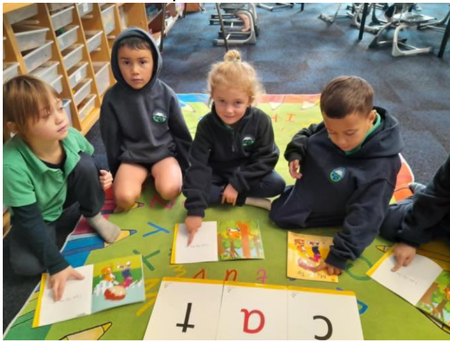
Literacy learning with our new entrants

It's arts fortnight and what fun we are having! Our focus has been on Matariki and creating multi-media artworks. We are exploring a range of art techniques, doodling on a dress with fabric pens, learning about collage, making a collaborative class korowai, using salt dough to make stars and so much more.