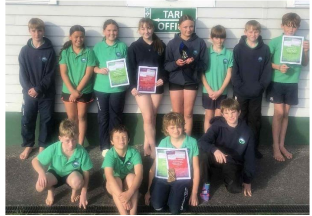
The hockey team