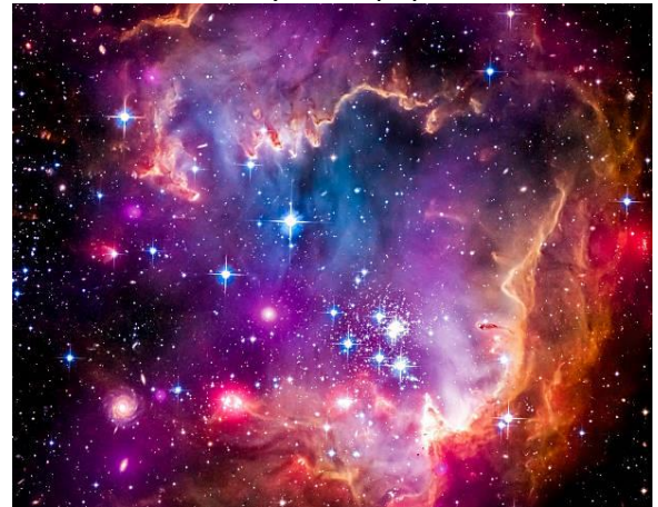
This is an example of the colours, patterns and ideas we will use to decorate our Matariki lanterns.