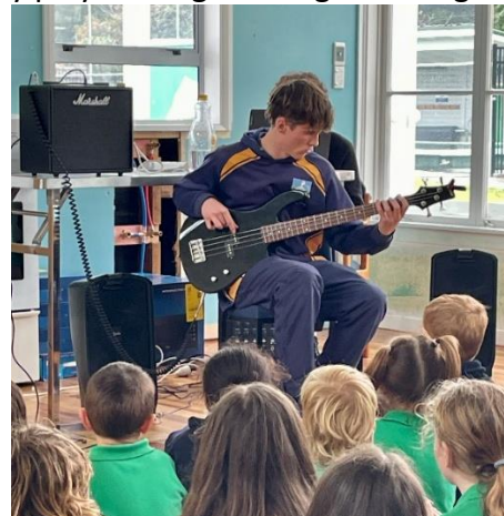
...and his bass guitar