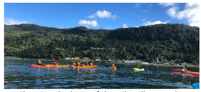
Showing the beautiful Waihi village in the background

It was a day filled with teamwork, learning, and laughter—an experience enjoyed 100% by all. Ngā mihi, Whaea Jessie.