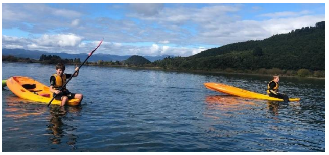
Zurich and Lucas showing off a new trick, sitting on the tip of their kayaks.