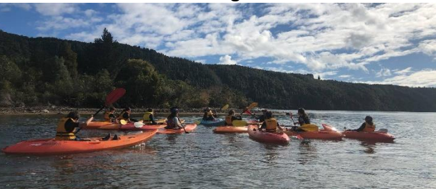
The race is on!