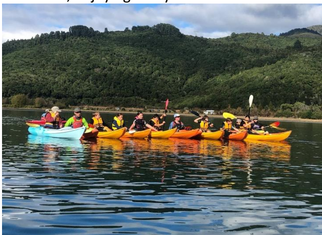
Raft up! A skill learned to gather and listen to the instructors.