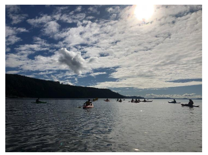
Look at those stunning cloud formations, the weather and conditions were idyllic