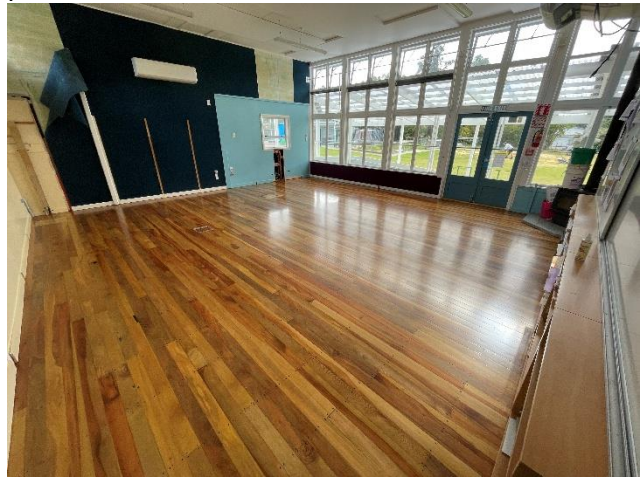
Our gorgeous newly sanded and varnished floor

The floor is now sanded and varnished, see the photo below: