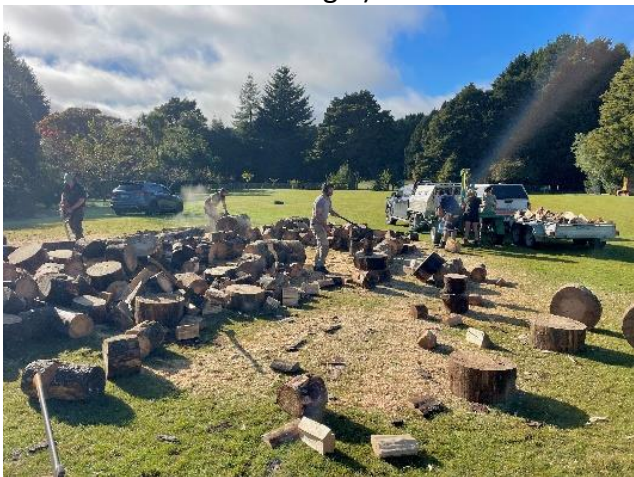
Sawing and splitting