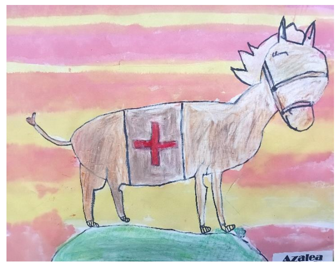
Azalea Te Ahuru-Te Paki