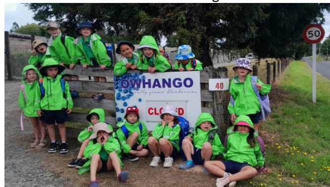
Arriving at the Blueberry Farm in our new class raincoats.