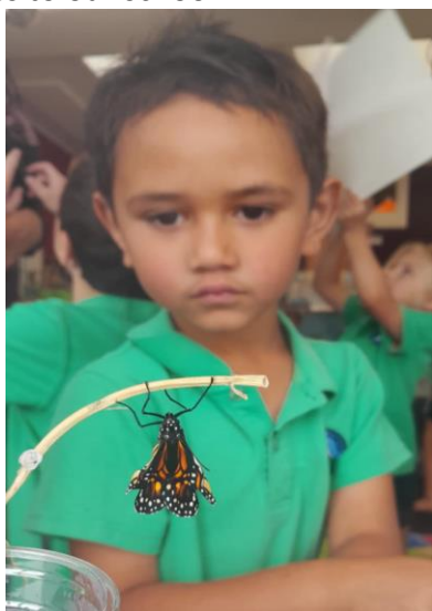
Kotuku observes a monarch.

attract more butterflies, each student made a colourful butterfly feeder to attract more butterflies to our school.