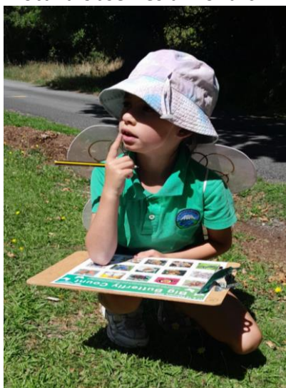
Indie recognises a butterfly on our hīkoi!