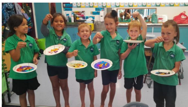
Butterfly feeders ready to hang.

Last week, Kōwhai students took a trip to the Ōwhango Blueberry Farm. Students were filled with excitement as they filled their puku with juicy berries and played with their friends. We picked an impressive 14kg of blueberries. We