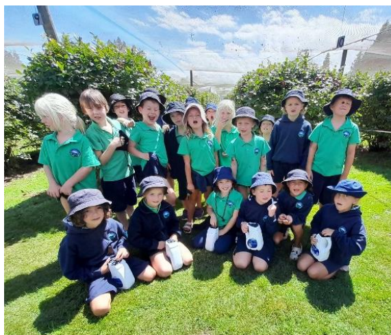
At the blueberry orchard