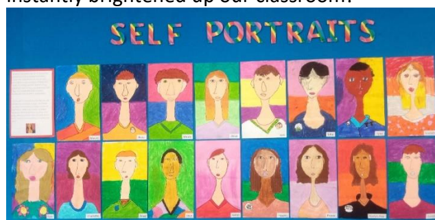
Amedeo Modigliani inspired self-portraits by Kahikatea

When thinking about a new name for our classroom, we came across Kahikatea and loved the meaning behind this mighty rākau. This native tree is unique as its root structure does not grow below ground, but rather across the forest floor to connect and intermingle with the roots of another Kahikatea. It is this intermingling of roots that makes it amongst the strongest and most resilient of native trees within the forests of Aotearoa New Zealand. Just like the Kahikatea, we will support and look after each other to be the best we can be. Kahikatea (the upper middle classroom) has had a fantastic start to the year. We started by writing about our goals, what we are looking forward to and what we are a little nervous about. We followed this up by creating a self portrait in the style of Modigliani, who was famous in the early 1900's for portraits that had a surreal elongation of faces and necks. This instantly brightened up our classroom!