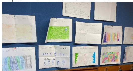
Designs for the ball wall

Entries for our new ball wall design are pouring in. They can be viewed in the corridor.