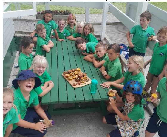
...and ready for eating