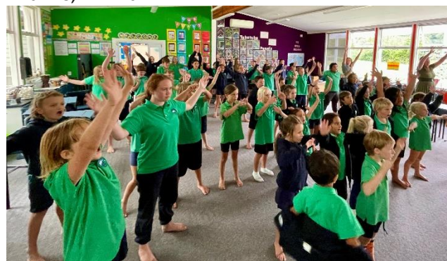
We are doing a lot of practises for our school show- learning the songs, dances and lines.

Kia ora e te whānau, Show rehearsals and preparations are well underway and we are beginning the hunt for a few items to borrow for props and costuming. Can you please get in touch with me in person or email ( emma@owhango.school.nz ) if you have any of the following items that we could borrow? - White/grey wig/beard - long cloaks (think Harry Potter) in both light and dark colours - matching short bob style wigs or sparkly wigs - sparkly material Thanks, Emma