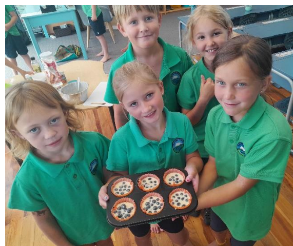
Blueberry muffins ready for baking...