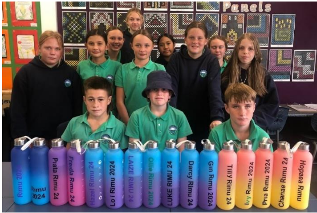
Some of the Rimu class students with their flash drink bottles