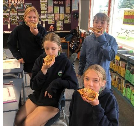
The class shared the pizza with the senior class