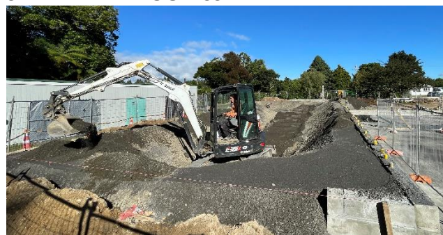
The base layer of our skate park is getting finer gravel layered on