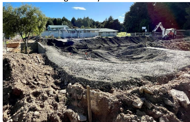
The bowl is starting to take shape