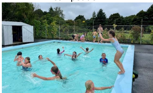
Some hardy swimmers enjoyed the last day our pool was open on Friday...