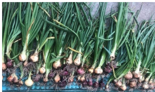
Our harvest of red and white onions from our garden

Garlic and parsley were added (from Whaea Regan's Garden. We plan to grow both in the school garden in this coming season) for added flavour, along with salt. This all made our delicious pizza topping. The beautifully risen dough was flattened out, our topping added and grated cheese applied (I wish I could say we made the cheese too, but it was not to be this time). After baking, students got to enjoy eating their efforts, perfect on a rainy Friday afternoon.