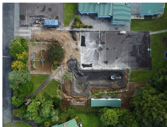
An aerial photo of the skatepark development