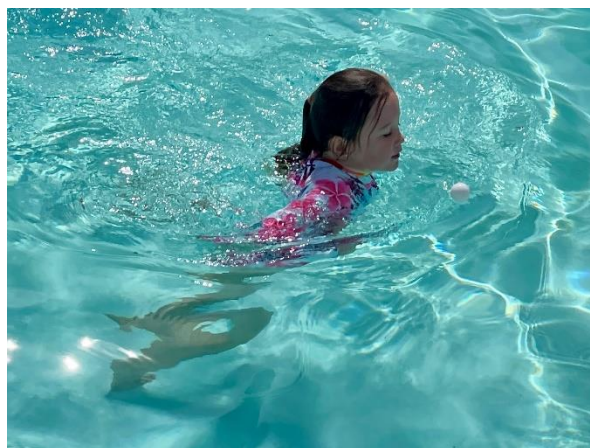
Leiki blows a table tennis ball the length of the pool