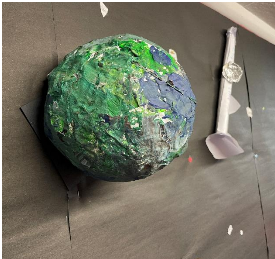
Our space themed corridor is taking shape

using the Numicon shapes to show the parts and the whole in these equations. We know that + means to add or stick together, that - means to take away, and that = means that both sides are the same amount.