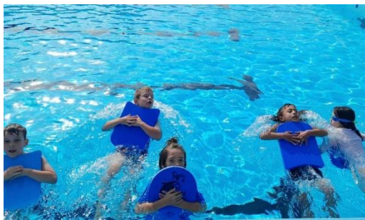
The width flutter board on back