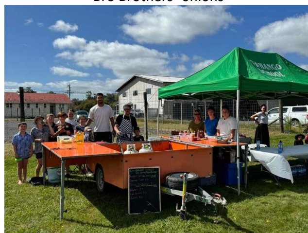
The team of wonderful volunteers at the coaching day food stall