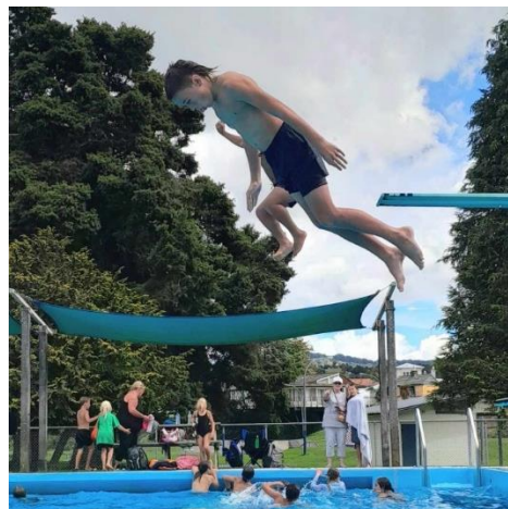
Delaize does a manu with four legs and three arms