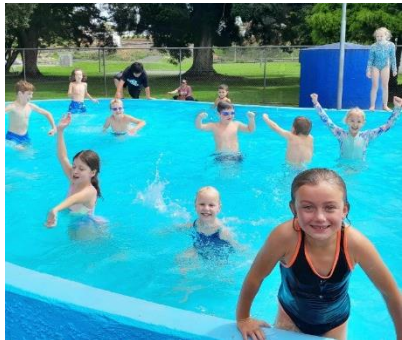
Having fun in the peanut pool