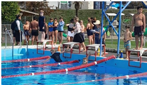
The length races