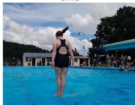
Piata stands on water