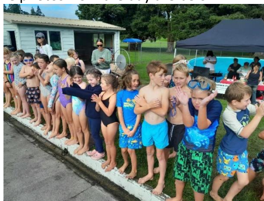
Lining up for the width races