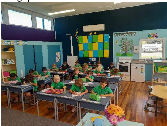
Our beautiful new classroom