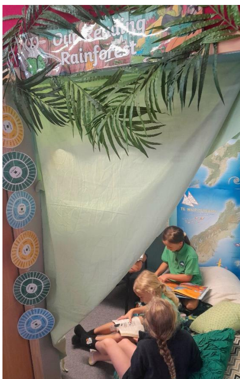
The Reading Rainforest