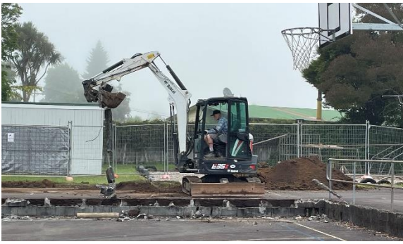
J starts preparing the site