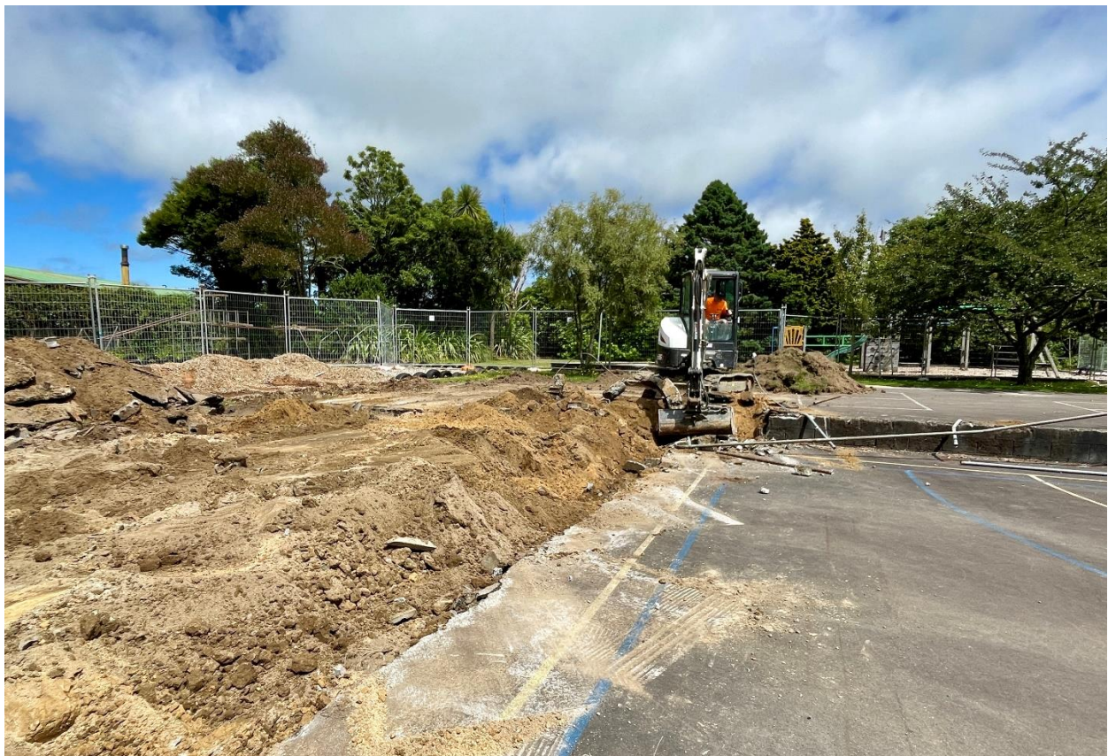
More Skate Park action