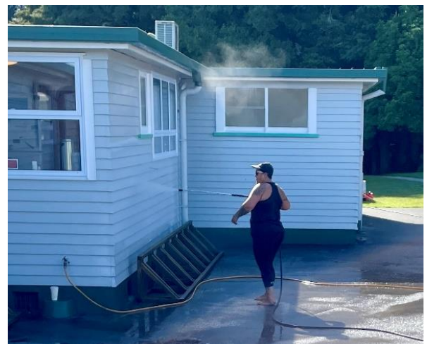
Kat water blasts the south side of the buildings and the moss that was growing on the ground