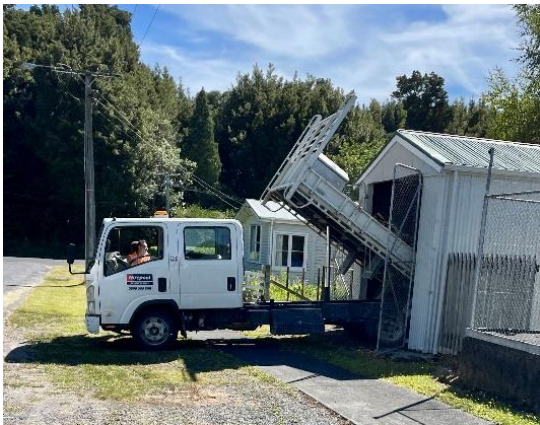
Te Hau off- loads another load of firewood. Thanks to the Petersen's for the gift of the slabs of firewood.