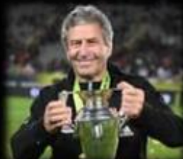
Sir Wayne Smith

Taranaki Bulls Backs Coach 2023 National Rugby Champions