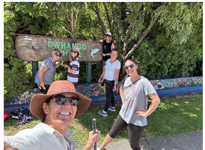
The school sign gets a sand ready for revarnishing

One of the goals in our Strategic Plan written last year is: As a community hub we encourage whānau and community involvement; this working bee is one way that we achieve this goal, by getting the community together, making connections and creating a sense of belonging.