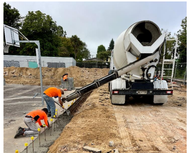
Our skate park is progressing well, with the first of many concrete pours today

We will have a yellow bin in the junior room that you can put them into. Thank you.