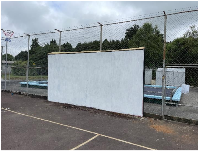
Our ball wall is ready for repainting