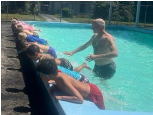
Swimming lessons- working on getting our legs long when we kick rather than using a bent leg