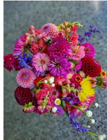
Flowers by The Grounded Artisan

Hi everyone. The Grounded Artisan is back again for 2024. If you would like to purchase a bunch of freshly cut blooms, bountiful in colour and ready to brighten up yours or a friend's day, please txt me on 027 331 9377. I can make up a bunch to suit any budget and 20% of sales go toward the Owhango School PTA. Signed Regan Hoban