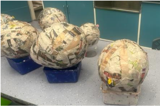
our paper mache planets are starting to take shape