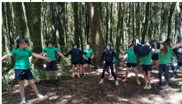
Senior room training for their Tongariro Alpine Crossing trip

Senior students must have trainers/sports shoes, water bottles and sun hats at school each Friday for our preparation walks and fitness activities