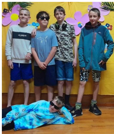
Some of the year 8 organisers