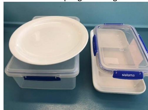
Four containers left behind at the Disco. Please collect them from the staff room.