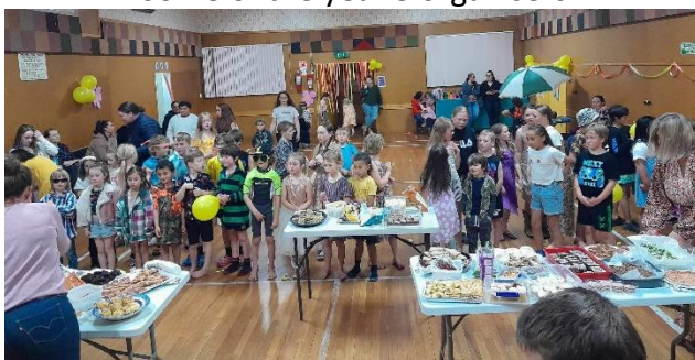
A well-deserved supper