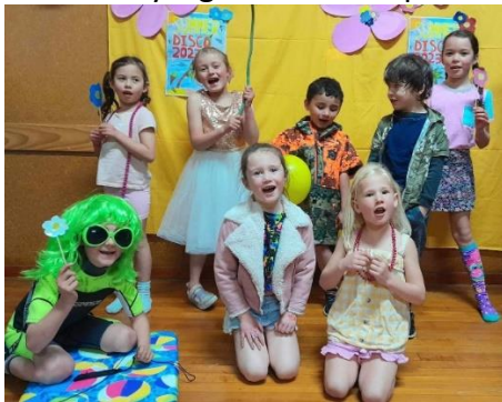
Summertime was the theme...