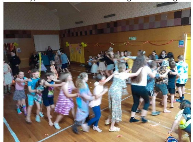
You can't stop a good conga line