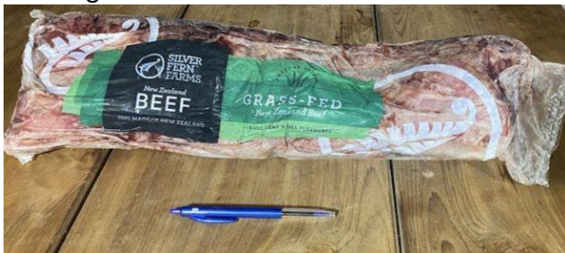
The 4kg Beef Cube

Any sold or unsold tickets are to be returned to school by Wednesday 1 st November. Thank you for your efforts with supporting the PTA with this. Signed The PTA