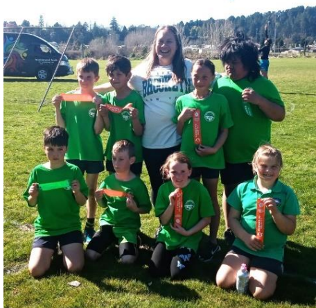
The football team with their ribbons