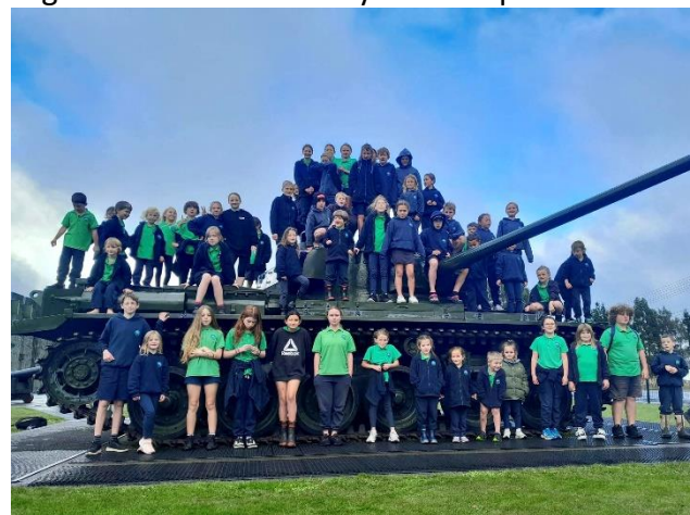
A trip to the museum is not complete without climbing on the tanks

Thanks to everyone who helped to make this trip such a success, especially to Whaea Siobhan who organised and ran the day. See the photos below.