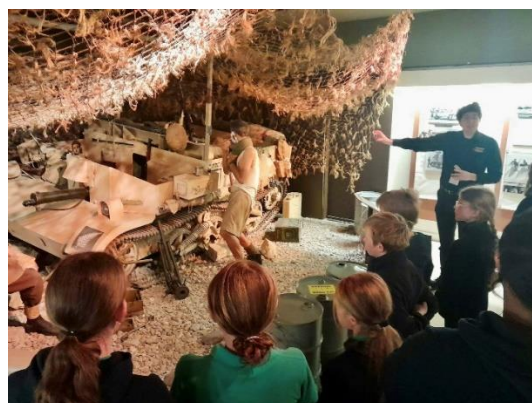
The guided tour