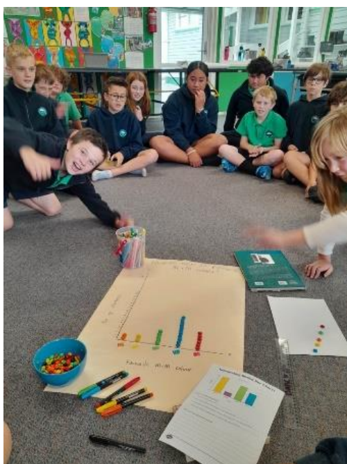
Who doesn't like problem solving with chocolate!