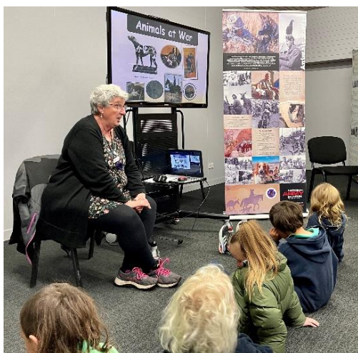
Learning about Animals at War