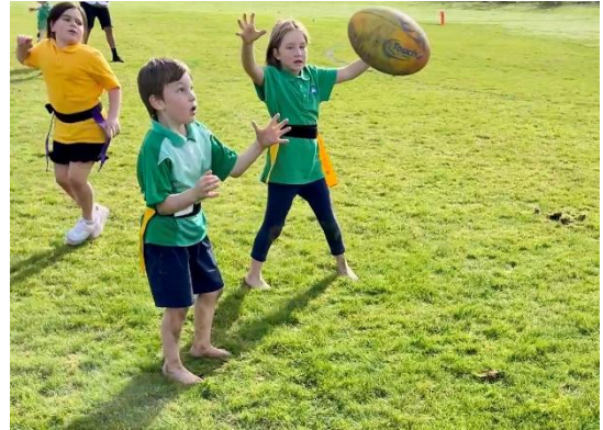
Decan catches the ball