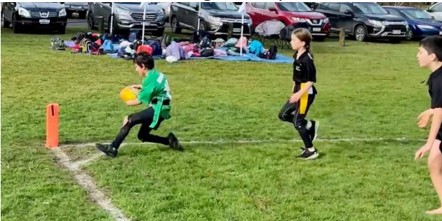
Tahu goes for the corner