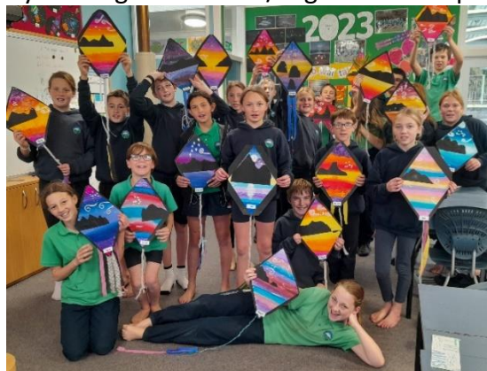
Senior Class with their manu tukutuku