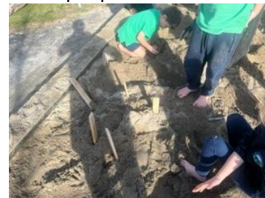
Digging like an archaeologist

It was the junior room’s turn to hold the assembly last week. We shared a whole lot of things that we have been learning about. We talked about our Aotearoa Histories learning, where we have been learning about early voyagers to New Zealand and what their journey might have been like. We even had a try at being archaeologists where we learnt how looking through old rubbish dumps (middens) can tell us a lot about how people lived at that time.