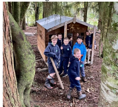
The whare has become a favourite play area