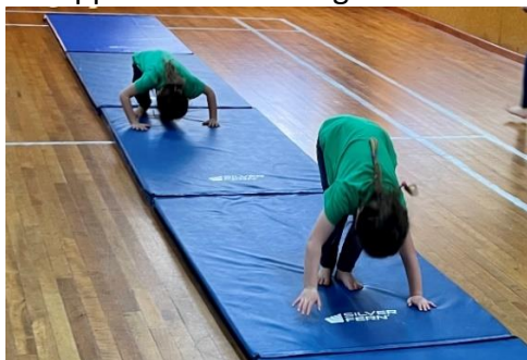
The juniors learning to forward roll