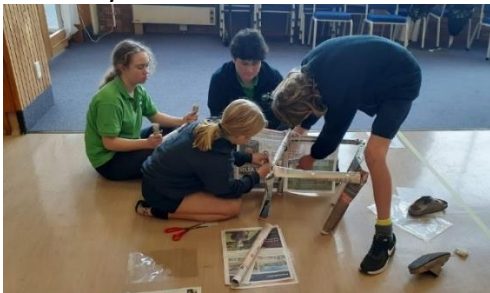
Teamwork making a dolls house

There were four challenges in total. They involved building strong / tall structures, dolls houses, flying jet planes, a Christmas tree (with accompanying Christmas song) and a board game. Our school entered two teams (that was the limit allowed) and the students represented Ōwhango brilliantly. We came away with a few placings, which we were all really pleased with. Such a fun day! Na Whaea Jessie