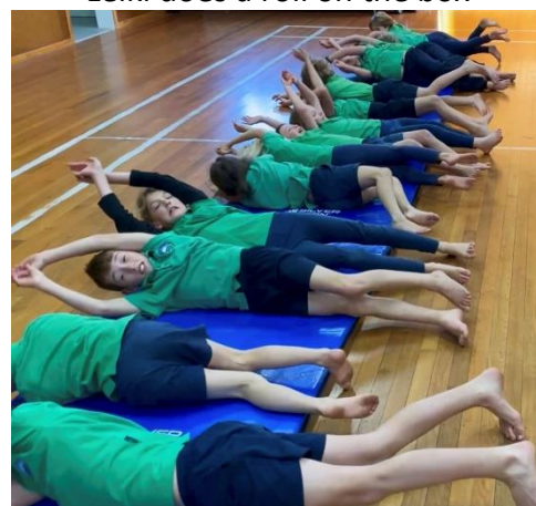
Co-ordinating the side roll as a team