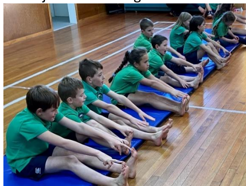
Who in the middle room can touch their toes?