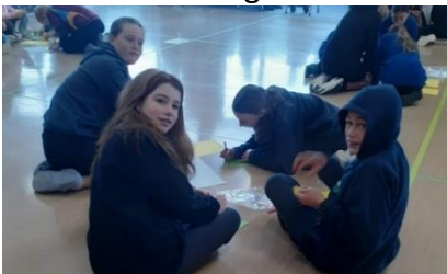
This team is focused on their one 'known challenge' a made-up board game