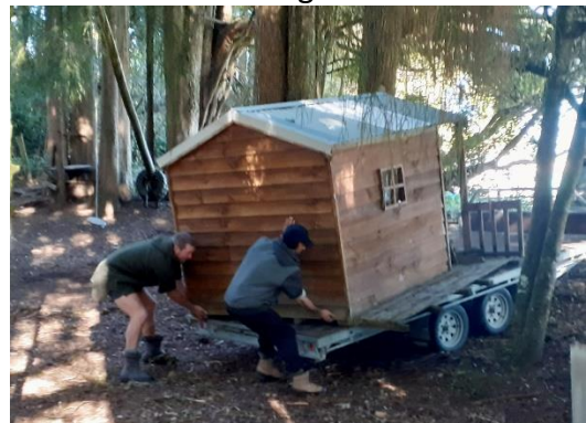
Sliding the whare off