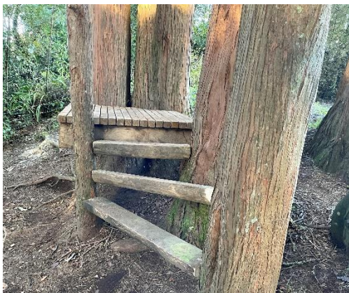
The new flying fox steps and take off deck

Transport: We are travelling to this event in a bus.