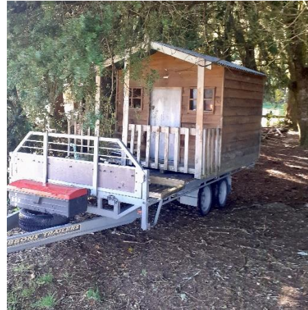
Careful backing of the trailer