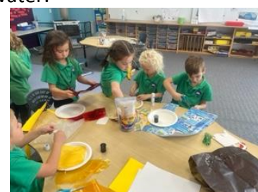
Making waka hourua

We learnt about waka hourua, the big double hulled vessels that the early voyagers used to travel the oceans and even had a go designing and creating our own. We learnt which designs floated best and which didn't by testing them in a tub of water.