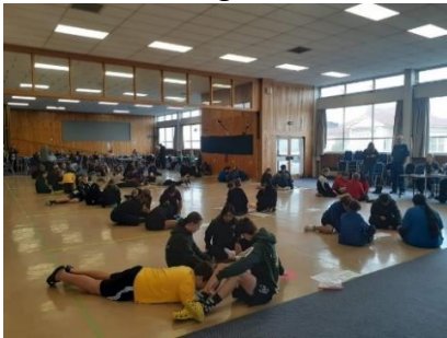
Many local schools participated.

students work as a team using simple materials to solve problems. It has strong links to New Zealand's technology, science and mathematics curriculum and other curriculum areas. In the weeks leading up to this challenge, we practised a couple of tech challenges in class.