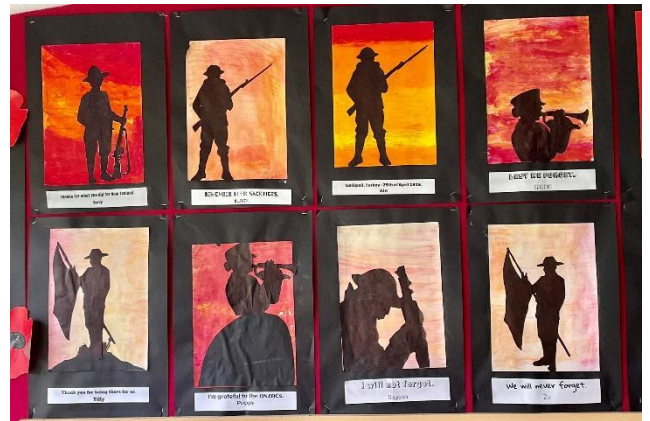
And two pieces of art by the seniors

We are still waiting for a few families to get their permission slips back to us so planning can proceed. These must be in by this Friday.