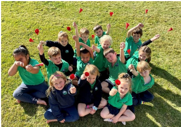
The juniors made paper poppies after hearing several stories around the ANZAC theme.