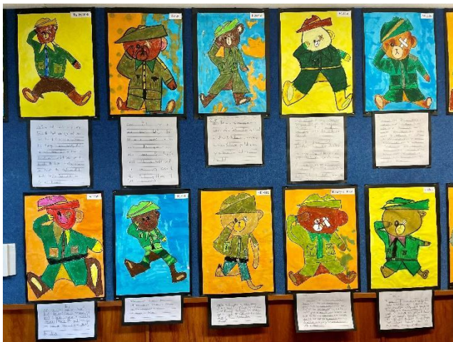
The middles have a new wall display in the corridor with their writing and art based on ANZAC Ted.