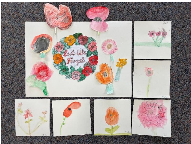
The juniors also drew poppies