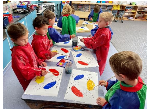
Using the primary colours to make secondary colours

before getting a new colour, how to brush excess water off your brush without splashing it everywhere, how to control where your paint goes, what adding white or black does to other colours, how to make the colour you want through mixing colours.