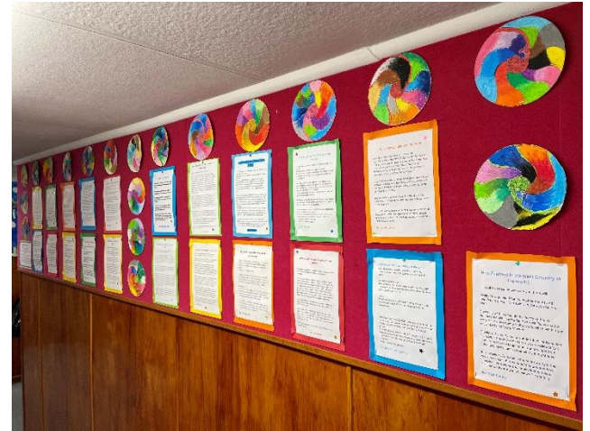
Our new wall display in the corridor