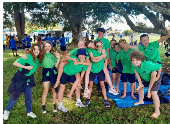
Our year 7 & 8 ki-o-rahi participants