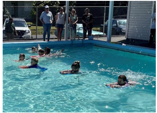
Long-leg kicking with a flutter board