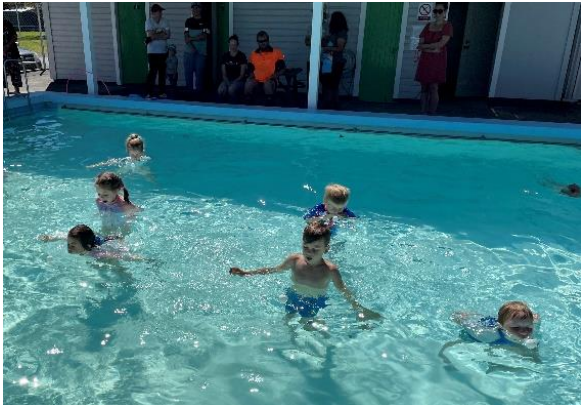
Practising blowing bubbles by blowing a table tennis ball across the width