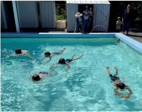
Gliding on the water