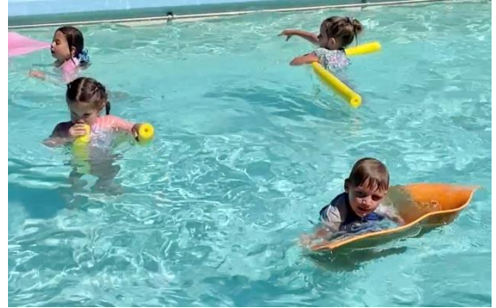
Free-time fun at the end