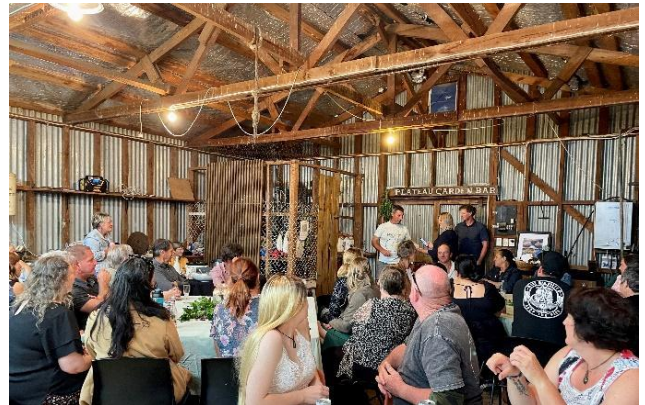
The delicious course in the Wheeler's woolshed followed with an auction and raffle draw