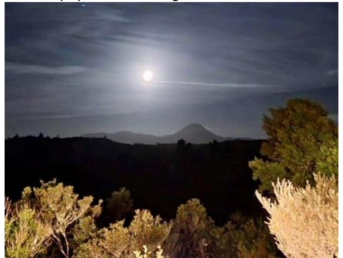
We were lucky to have a calm, warm night, with mārama in her full glory