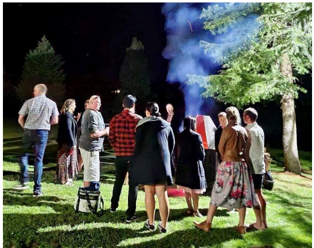
The huge, glowing brazier at the Ogle's house was popular for eating dessert around