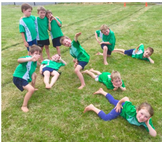
This is how the year 1 & 2 team celebrated their first win of the day

Please return your washed school sport T-shirts now.