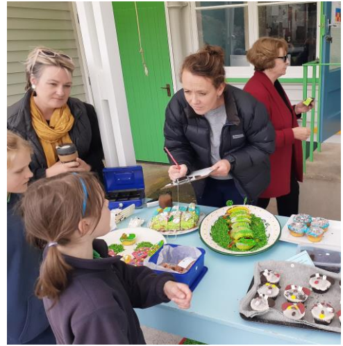
The PTA sales table was very busy