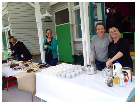
More lovely volunteers helping with the PTA classic car lunch fundraiser