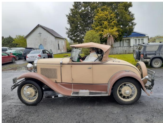
One of the participants in the car rally departing with a full belly