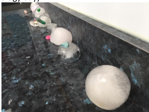
Part of the junior science work exploring ice

The children have requested that we have a Halloween themed dress up day on Wednesday 30 th October. So we are. If you are not participating, then wear your school uniform. (Note it is the day before Halloween so that the year 7 & 8 children can participate- the 31 st is a technology day).