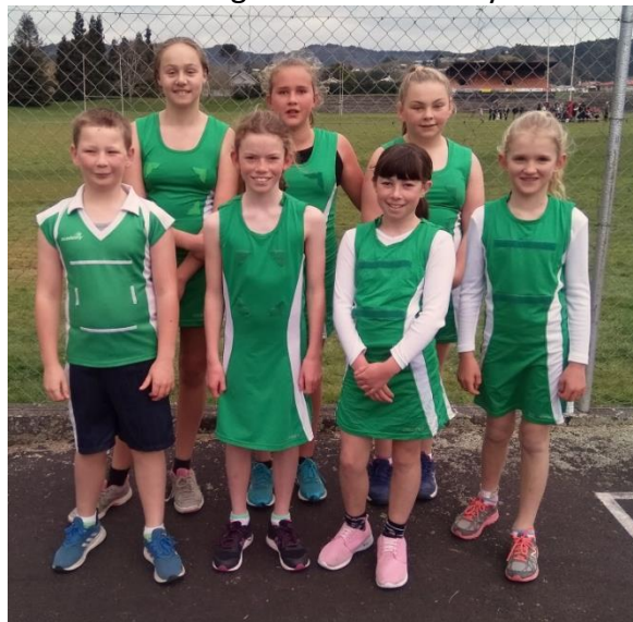
The Mountaineers netball team

Well done and congratulations all of you.