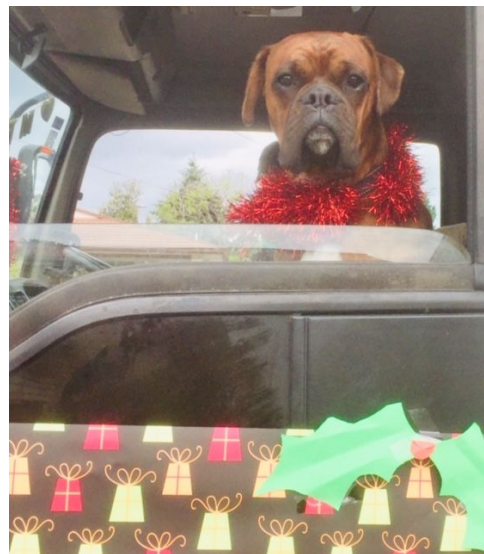
Beau was a bit of a hit in the passenger seat