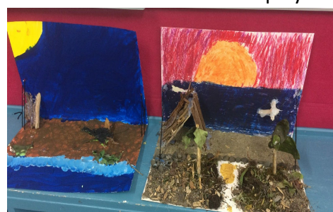
Our models of where the Hatchet book is set