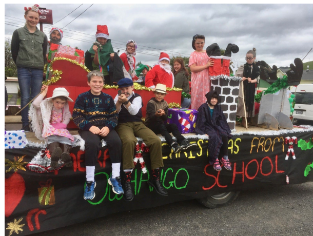
We had a lot of fun on our float- singing, blowing bubbles and greeting the bystanders