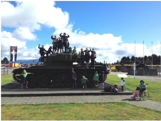
A must-do when visiting the museum- climbing on the tanks