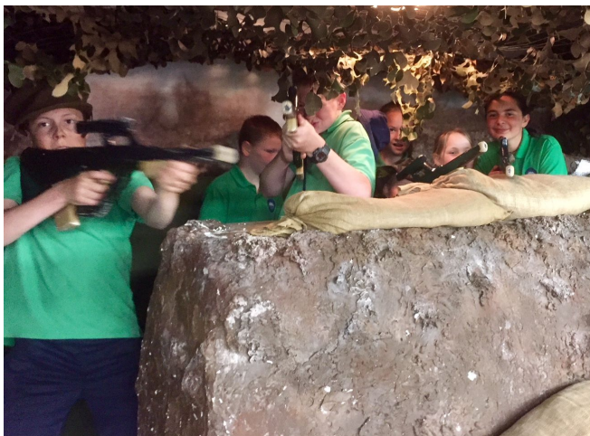
A brief play time with the wooden guns before we cooked our lunch