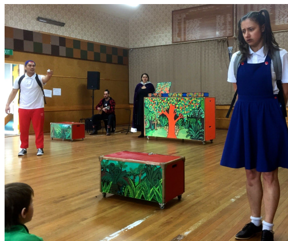
Taki Rua performance

Last Tuesday afternoon we had a visit the Taki Rua group, who did their play Hinekihawai. It was perfect timing for the children having just had a week of intense drama instruction. The whole performance was in te reo, which was a great challenge for our children to step out of their cultural comfort zone, and engage using skills other than English. It was followed up with a question and answer session with the actors, which showed that the children had understood the story line. At one point we had a few children in tears as one scene showed a brother and sister in an accident, the acting being so powerful that the children comprehended what was happening. Again, thank you to the PTA who paid for the cost of our children to attend this show.