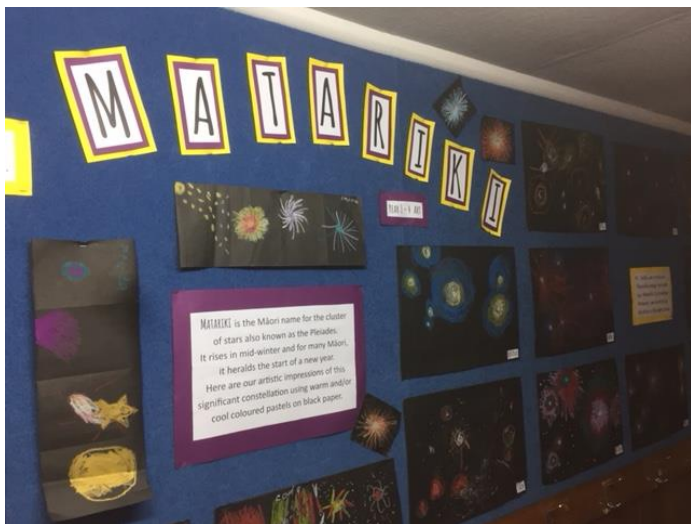
The wall display in the corridor