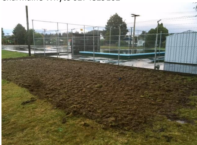
Our new garden.