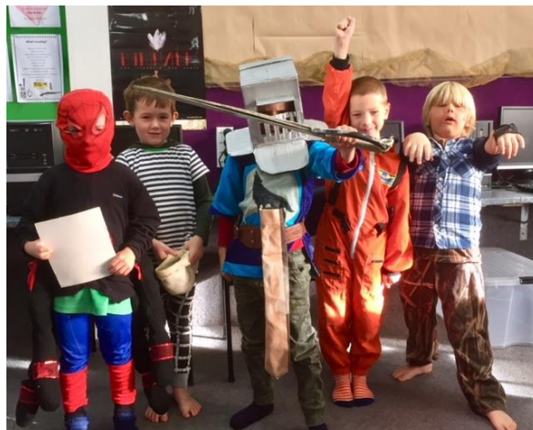
The junior boys book characters

One thing I love about this school is how well the children get in behind these fun days. We had some clever costumes and characters. See the photos below- or more on Facebook