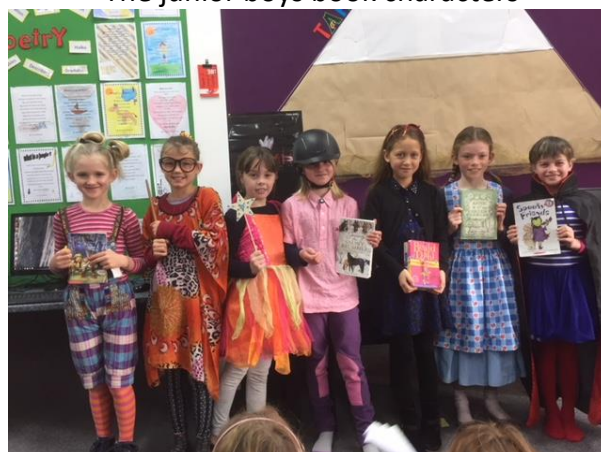
The middle room girls book characters