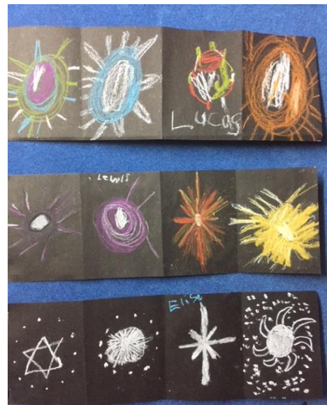
Some of the progressions of ideas as the children explored different ways of drawing stars