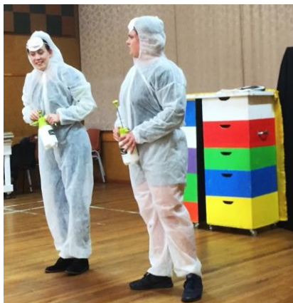
Spraying the plants, weeds and bees with cleaner-upper-cide

On Friday we had the performing group Co Theatre Physical perform their show, Royal Jelly, in the Owango Hall. Living in a rural area can make it difficult to offer opportunities for our children to see theatrical events, so this was a real treat. The children reacted well to the well thought out show, and marvelled at how two actors can become a variety of characters to tell a complex story around a current environmental issue. It was also nice to share this occasion with other rural-small schools- Ohura, Kaitieke and National Park schools. Once again, I would like to thank the PTA for paying our fee so that the children could attend for free.