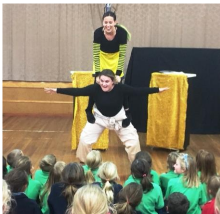
Flying around the flower fields