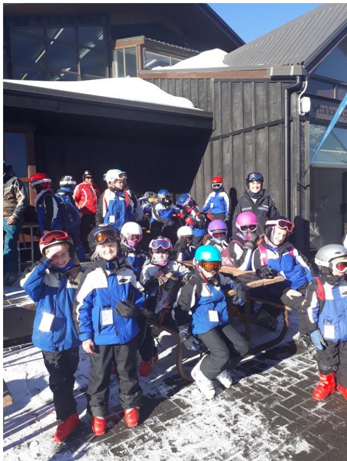
Our students first day with National Park School Skiing.